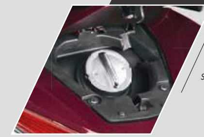
DOUBLE LID EXTERNAL FUEL FILL

One compact console ensures safety of the vehicle and convenience of opening underseat storage & external fuel lid.