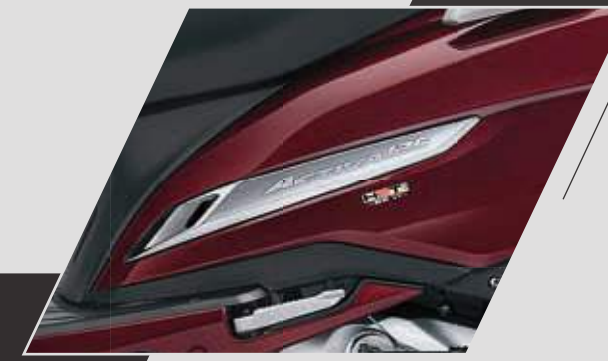
PREMIUM CHROME ON BODY

Spacious front glove box adds additional storage space.