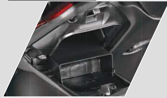
FRONT GLOVE BOX

Fuel filling right at your fingertips. Now get fuel filled while sitting on your scooter.