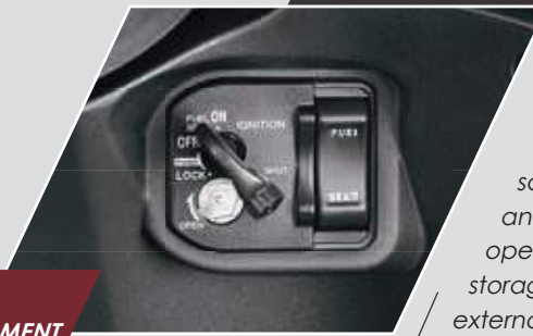
MULTI FUNCTION SWITCH UNIT

One compact console ensures safety of the vehicle and convenience of opening underseat storage & external fuel lid.