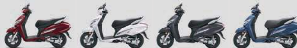
Rebel Red Metallic Pearl Precious White Heavy Grey Metallic Midnight Blue Metallic

*The technical specifications and design of the vehicle may vary according to the requirements and conditions without any notice • *Distance to empty, real time and average mileage readings may vary as per variant and riding conditions • Activa 125 meets Bharat Stage VI norms • Product shown in the picture may vary from actual product available in the market • Accessories shown in the picture are not part of standard equipment • The technical specifications mentioned are for Deluxe variant • ^Mileage has increased by 13% for Activa 125 BS-VI Deluxe variant as compared to the Activa 125 BS-IV Deluxe variant • All features and colours may not be part of all variants • **Conditions apply